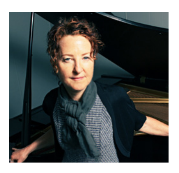
Click on the images above to download high resolution files.